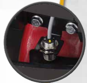
Yale Smart Slow Down™ sensor

To further ensure that every load remains stable, the Yale® MPB-VG truck features optional Yale Smart Slow Down™ technology. When the operator turns the truck to change direction, the Yale Smart Slow Down™ feature intuitively reduces the truck's speed, assisting the operator through the corner. This enables the operator to maneuver through the warehouse with confidence—giving the MPB-VG best-in-class stability.