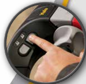
Yale Smart Lift™ technology reduces cycle times.

You've got to move loads—we understand that. Holding the lift button and waiting for the pallet to lift is time you don't have. That's why we created Yale Smart Lift™. It's a Yale patented feature that increases productivity by enabling the operator to begin transporting the pallet before the unit is at full lift. The MPB-VG equipped with this option will automatically lift the pallet to maximum fork height without having to continually hold the lift button. As a result of the simultaneous action of lifting and traveling, Yale Smart Lift™ can reduce cycle times by up to 25%.