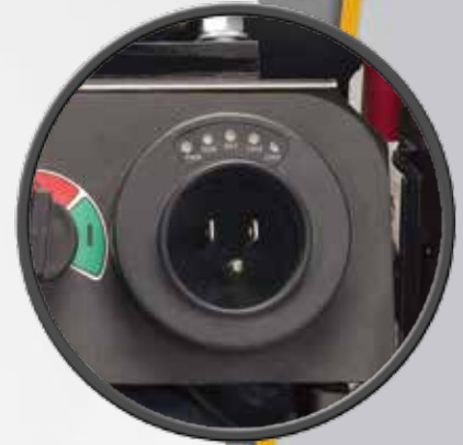
Optional easy access charge port.

Easy service is the hallmark of Yale® trucks, so when it comes time to service the new walkie, we've made certain you'll be back up and running faster than ever. For instance, the easy-to-remove cover provides convenient access to main components—and requires no tools. Plus, lube fittings at all major linkage points are highly accessible, ensuring easy maintenance and a longer service life. And flag pins throughout the linkage system enable pins and bushings to be easily serviced. Not to mention, an optional charge port is conveniently mounted to the front of the truck for easier access.