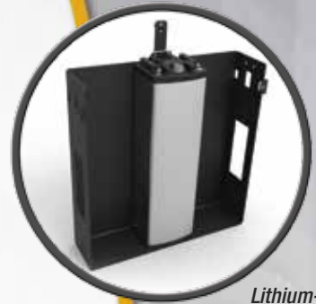
Lithium-ion battery pack

The cell construction design is ideal for applications where vibration or contamination issues are a concern. No equalization charge is required, and opportunity charging is performed with no negative effect. The lithium-ion battery pack comes with a 60 month/10,000 hour warranty.