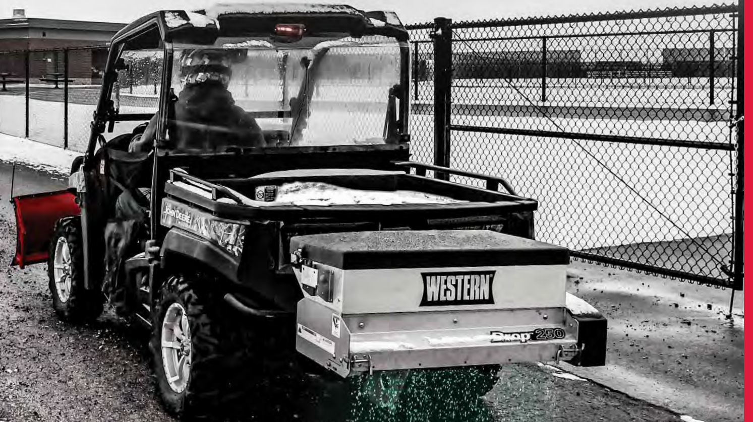
Shows with optional cover accessory.