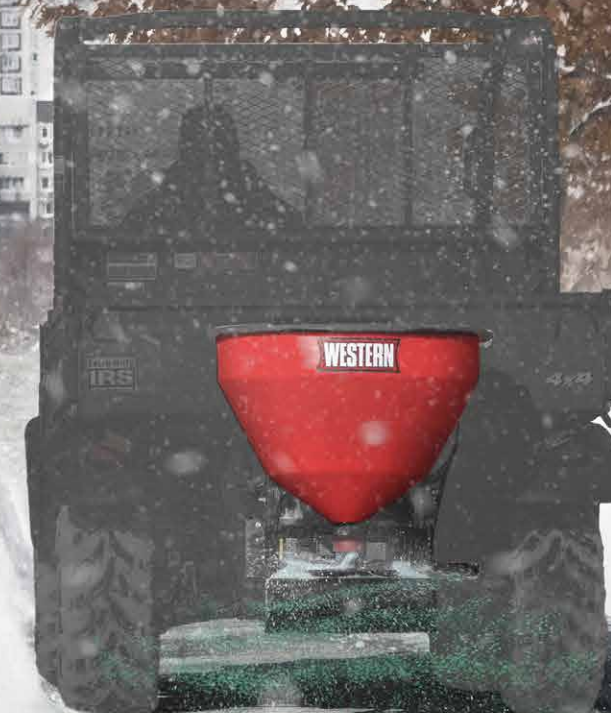
Shown with optional cover accessory.

MOUNT OPTIONS: Standard 2" Receiver, Optional Drop Utility, 3-Point Mounts