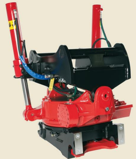
RT 80 S70/S70 with double acting cylinders