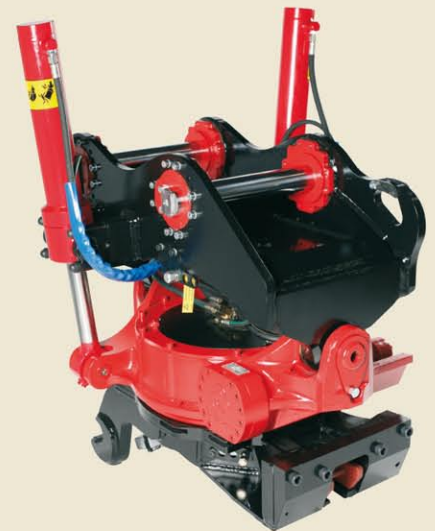
RT 80 Multi/S2 with double acting cylinders

The pictures above only show two of several possible configurations for the RT 80.