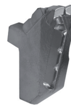
Side scraper Type MH