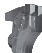
Tooth type C/SS (side scraper)