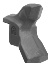
Tooth type G/3 (option)