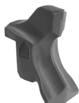
Tooth type B/3

Data refers to the machine without options.