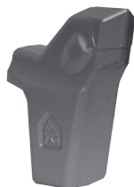
Tooth type F (option)