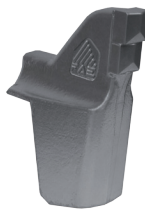
Tooth type A/HD (option)