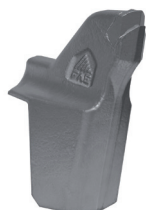
Tooth type A (standard)

Data refers to the machine without options.