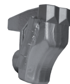
Tooth type C/SS (side scraper)