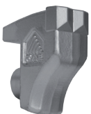
Tooth type STCL

* For 540 RPM tractors max power 100 HP.