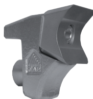
Tooth type D COBRA (option)