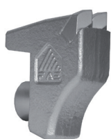
Tooth type C (standard)

Data refers to the machine without options.