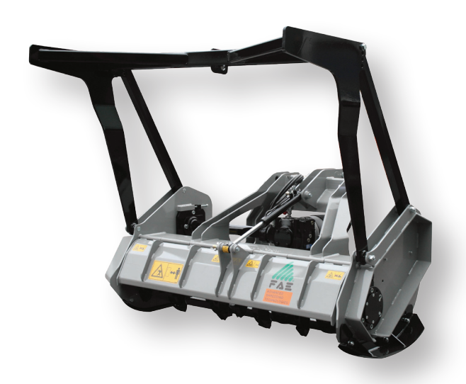
Especially developed for tractors with low three point hitch (e.g. crawler tractors).

Standard equipment: PTO drive shaft with cam clutch, gearbox with freewheel, hydraulic rear hood, ajustable skids. Options: hydraulic top link, special skids to go underground, push frame, option of rotor equipped with tooth type "C/HD" or "D". Notes: For the correct usage, creeper gear transmission and reversible driving console are recommended.