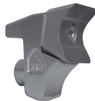
Tooth type D COBRA (option)