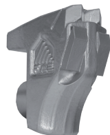
Tooth type C/HD (option)