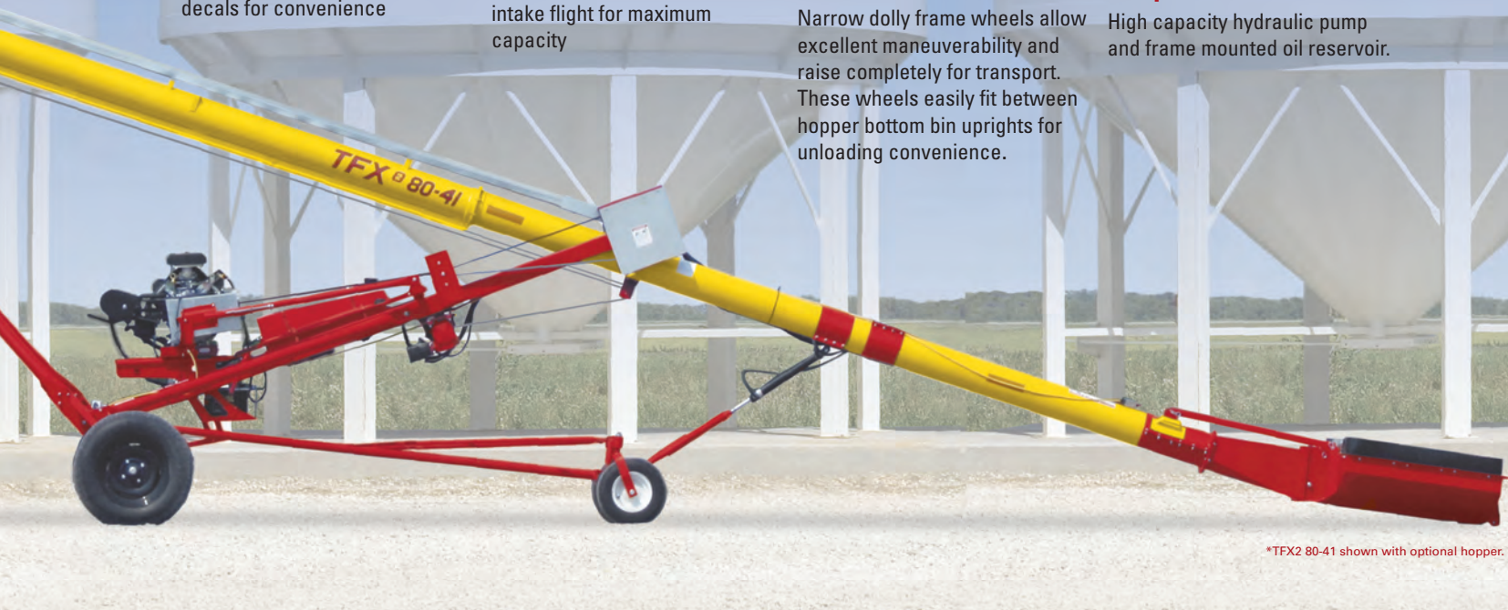
*TFX2 80-41 shown with optional hopper.

High capacity hydraulic pump and frame mounted oil reservoir.