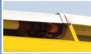
Chain coupler on driveshaft