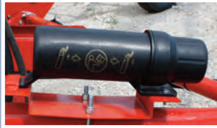
New manual holder and service decals for convenience