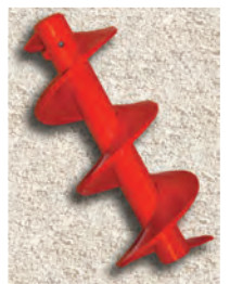
Stub Flight Section