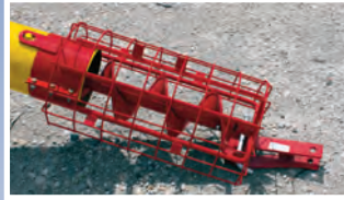
The TFX2 80 with improved intake flight for maximum capacity