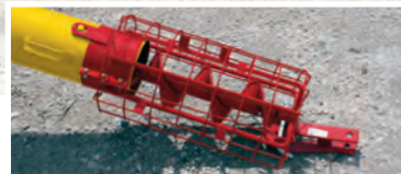
*TFX2 80-41 shown with optional hopper.