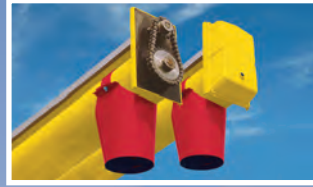
Larger drive bearings