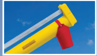
Bolt on downspout