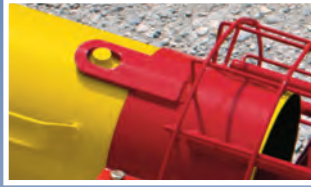
New intake "lock" to prevent the intake from shifting in transport