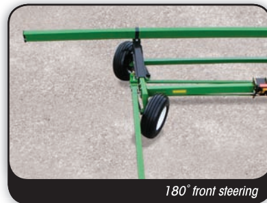
180° front steering