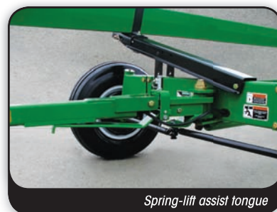
Spring-lift assist tongue