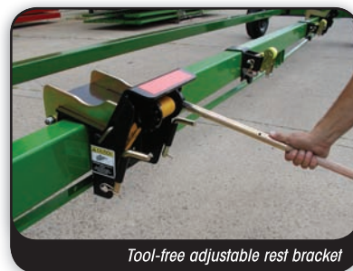
Tool-free adjustable rest bracket