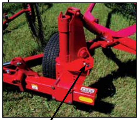
Adjustable windrow width