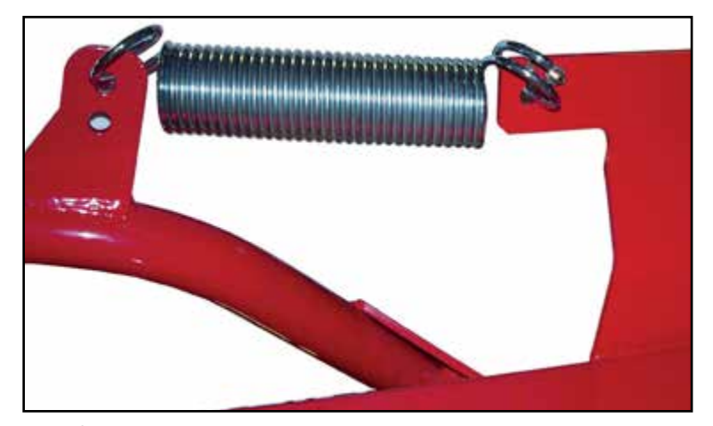
Each finger wheel has an independent spring suspension that allows it to follow field ground contours.