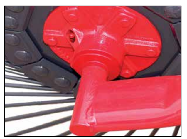
An anti-wrap seal protector on the backside of each finger wheel hub adds more protection for the seal and bearing.