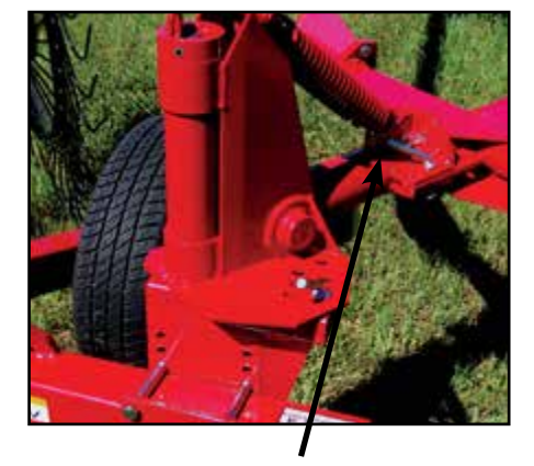
Spring adjustment for finger wheel ground pressure