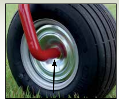
Anti-Wrap Stationary Disc