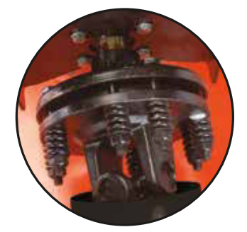
Adjustable Slip Clutches are standard equipment