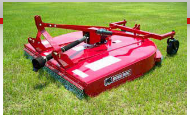
BH27 with Dual Tail Wheels Shown with Chain Shielding Selection