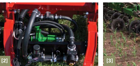
[1] Toolbar [2] Pumps [3] Coulters [4] Custom solution tank [5] Tires and Axles

A 1600 U.S. gallon custom tank and 8" deep sump provides thorough clean out. The double 4" \times 6" mainframe toolbar is available in widths up to 42.5'.