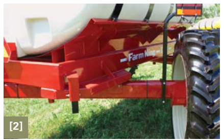
[1] Custom tank w/ 8 inch deep sump [2] Full pan tank saddle [3] 10 bolt hubs[4] Plumbing

A high capacity 1600 U.S. gallon tank holds ample product for almost any task. A telescoping front hitch makes the 1700 simple to hook up behind implements. The 1700 converts easily from two-wheel steering to four-wheel steering. An excellent crop clearance helps make the 1700 more flexible for your operation.