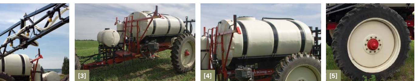
[1] Boom suspension [2] Lattice-style boom [3] Frame [4] Custom solution tank [5] Tires and Axles

The simple and efficient design make the Farm King utility sprayer easy to operate and maintain. Boom height adjustments are easily made using the single hydraulic cylinder and vertical mast. Farm King Utility Sprayers are available with 60' booms.