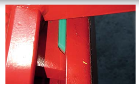
Special nylon plate fitted into sliding guide rail ensures smooth movements without the need for lubrification or maintenance.