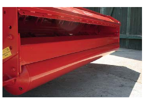
The rear roller is standard equipment, its diameter is 160mm. Adjustable scraper ensure a correct field performance.