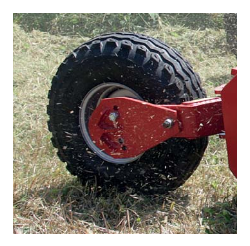
Semi pivoting wheels (10/8.0 x 12.8 ply) as standard ensure good stability and a constant working depth of the FXZ during field operations.

The same rotor can be equipped with either Y blades or hammer blades; in all configurations special fan blades lift the material up for a better shredding effect. The big diameter (760mm) guarantees an excellent cut with low power requirement.