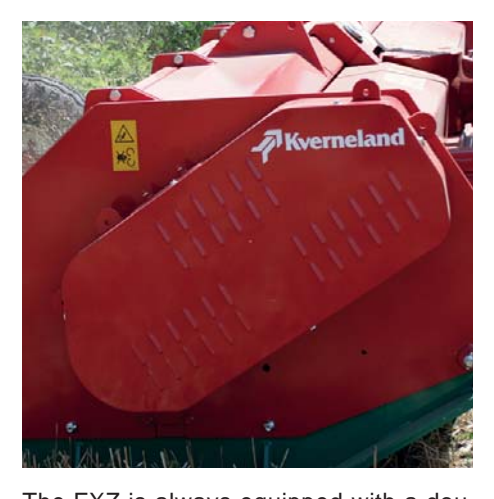
The FXZ is always equipped with a double lateral transmission. External and centralized greasing points of the rotor ensure a quicker maintenance.