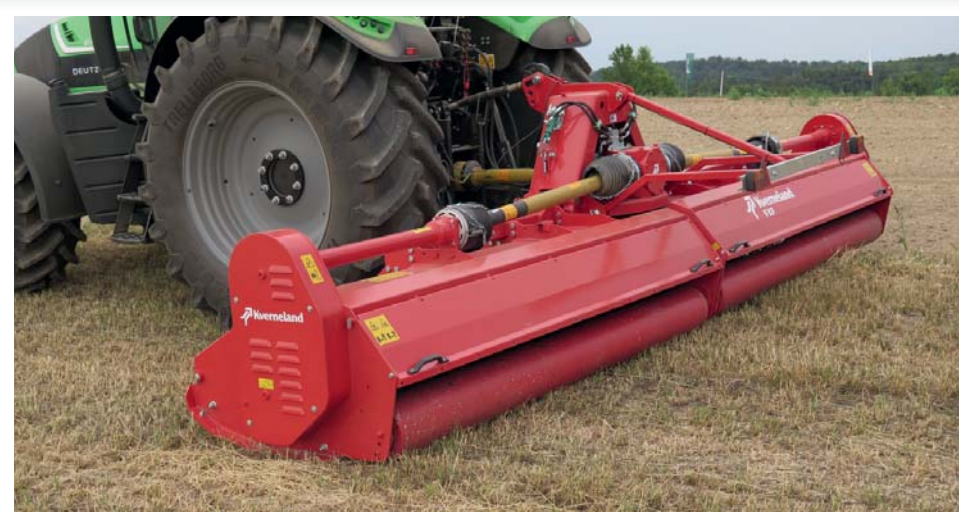
Working width from 560 to 640cm. The standard roller (Ø245mm) is running close to the profile to ensure a self-cleaning effect.