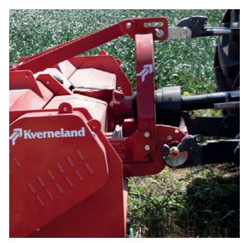
Semi automatic linkage (Cat III) allow fast coupling of FXZ. In addition the floating bracket on 3rd point permit an easy control of the working depth without stressing force on the headstock.