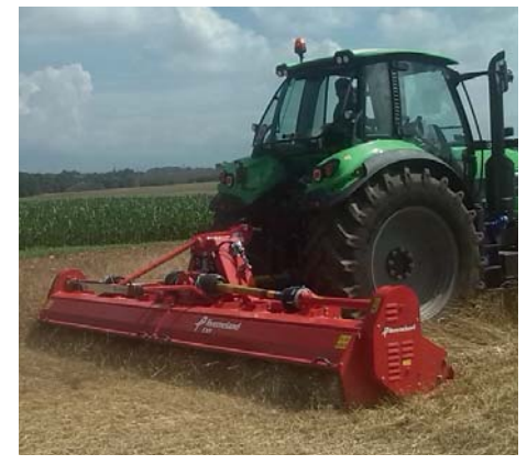
The central gearbox (250hp) is equipped with free wheels; the lateral transmission (5 belts each side) with an automatic belt tensioner ensures reliability and a low maintenance effort.