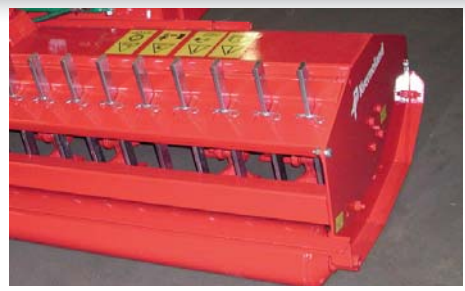
The Kverneland FHS can be equipped with rake tines to improve chopping on prunings.