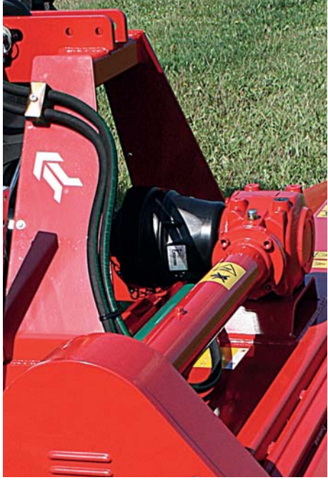
Gearbox up to 80hp - PTO speed drive 540 rpm. Protected by integrated free-wheel.