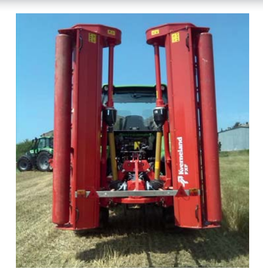
Transport width 250cm.