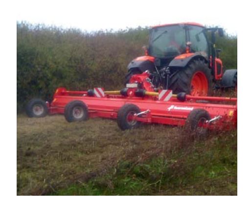
Semi pivoting wheels (10/8.0 x 12.8 ply) as option ensure a good stability and a constant working depth during field operations.