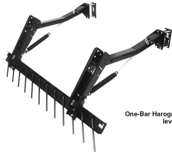
One-Bar Harogator leveler

Outstanding durability is the result of powder-coated painting, heat-tempered teeth, and the "kick-back" hinged leveling bar that protects against damage from rocks and other field obstacles or when the implement is being backed or lowered.