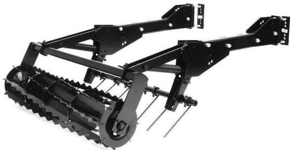
Single Rolling Harrow Basket

The Single Rolling Harrow Basket attachment is available in 15- and 20-foot widths and can be fitted to selected John Deere, Case IH, Great Plains and Tye drills.