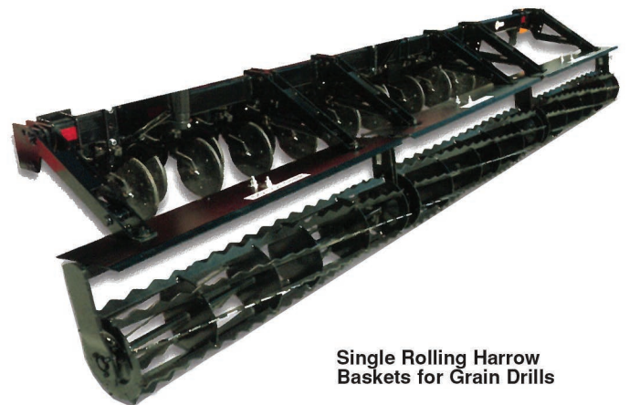
Single Rolling Harrow Baskets for Grain Drills