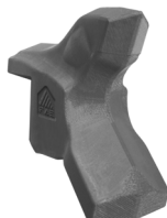
Tooth type G/3 (option)