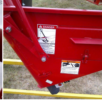
Handy clean-out door and quick-dump chute