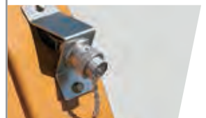
Front Electric/ Multi-Function