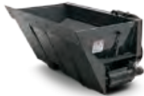
Side Discharge Bucket