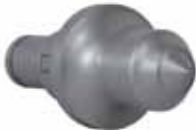
Tooth type R

Data refers to the machine without options.