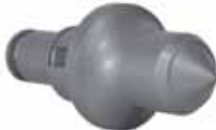
Tooth type R/HD