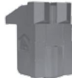
Tooth type STC/FP (side scraper)