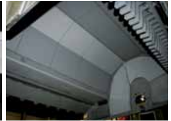
The front hood with hydraulic adjustment for a better protection of the tractor.