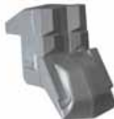
Tooth type STC/3/FP (side scraper)