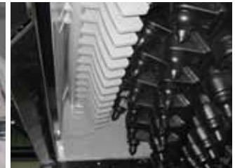
To ensure the desired granulometry the machine is equipped with an adjustable HARDOX® counter blade and an adjustable grid on the rear hood. The grid is independent from the hood in order to also work on wet material.