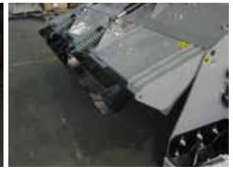
Rear hydraulic protection/grader hood to level the output material.