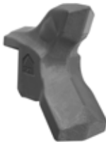
Tooth type G/3 (option)