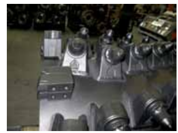
The rotors are equipped with 2 different type of scraper teeth in order to keep the inside of the machine clean and dirt free