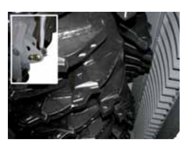
The adjustable grid on the rear hood is independent from the hood in order to work also on wet material (setting slots in the detail)