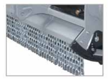
Front hood with hydraulic adjustment for the output of the material and for a better protection of the tractor