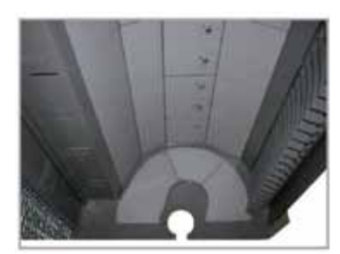
The internal protections of the machine are in HARDOX® steel, fully and easily interchangeable, ensuring a greater resistance to wear and reducing maintenance costs