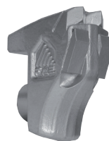
Tooth type C/HD (option)