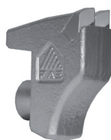
Tooth type C