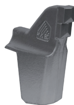
Tooth type A/HD (option)