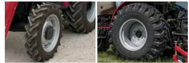
R1 tire – standard tread, agricultural application