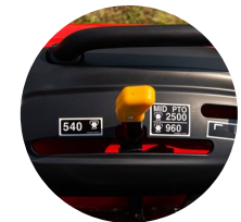
5. PTO lever