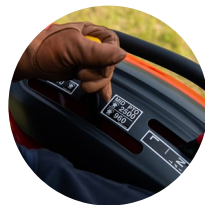
3. Ergonomic lever