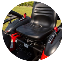
2. Comfortable suspension seat