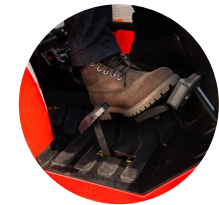
4. Highly responsive forward & reverse HST (2400H)