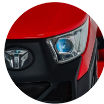
1. New iconic hood

A versatile and highly maneuverable Series 1 tractor perfect for hobbyists to groundskeepers. Enjoy the size of a riding mower with the capabilities of a full-size tractor.