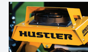
9" Fan & High Capacity Oil Cooler with Hot Oil Shuttle

Increase the life and performance of your mower with Hustler's exclusive HyperDrive system, the largest, most durable drive system in the industry. With temperature regulation and heavy-duty components, HyperDrive will keep you operating at peak performance.