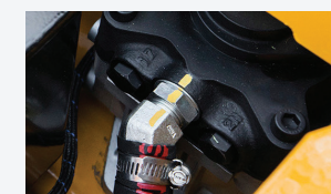
Industrial-Grade Slipper Piston Pumps