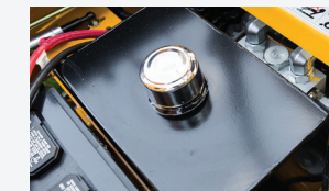
Large Oil Reservoir