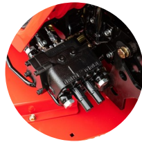
2. 3rd function for 4-in-1 bucket work