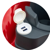
3. 2 USB ports