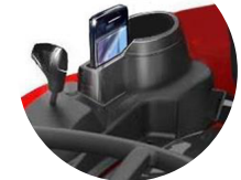
5. Wireless smartphone charger