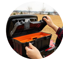
6. Wide loadspace with a well-equipped toolbox