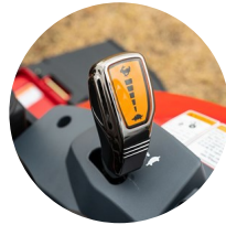
1. 2 range hydrostatic transmission (HST)

Get work done quicker with this small-frame tractor. Highly maneuverable and with maximized lift capabilities, the T25 is designed to be an all-round multi-tasking machine.