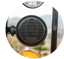
4. Bluetooth speaker with IP66 grade waterproofing