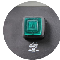
1. Cruise control switch

Take on tough jobs in tight spaces with the T494. This tractor brings you the best features from our compact and utility ranges, balancing high power output with maximized maneuverability.