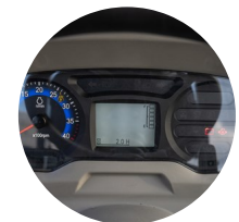
6. Digital instrument panel