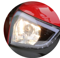
2. Projection headlights