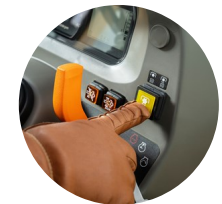
5. PTO switch