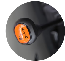
4. 3-range HST & 8F x 8R gear transmission