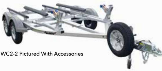
WC2-2 Pictured With Accessories