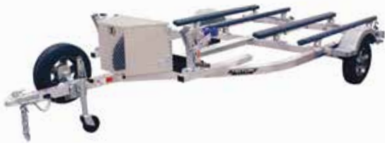
ELITE WCII Pictured With Accessories