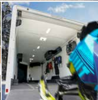
Multi-Season Enclosed Trailers