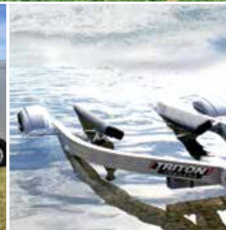
Personal Watercraft Trailers