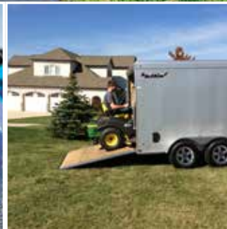
Cargo & Utility Trailers