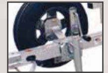
08519 Spare tire carrier (tire not included)