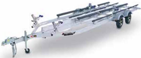
ELITE WCIV Pictured With Accessories