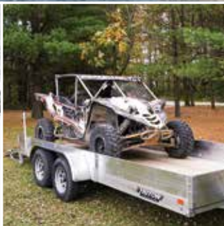
Off Road Vehicle Trailers